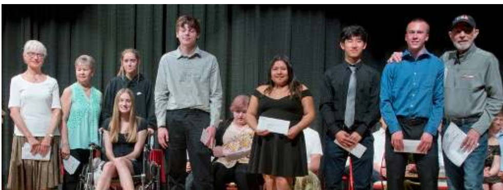
2022 Recipients of the Kikkoman Scholarships

Veronica Hookstead-West Memorial Scholarship Jean Broman Olson Art Scholarship Elizabeth A. Parenteau Spirit of Service Award Anthy J. Weiler Memorial Scholarship Dirk Seibold Memorial Cross Country & Track Scholarship Linda Stimpson Memorial Scholarship Don Hale Home Lumber Carpentry Scholarship Bob & Jill Freiermuth Key to Business Scholarship Bob & Jill Freiermuth Working Towards Success Scholarship Roxa Pritchett Music Scholarship